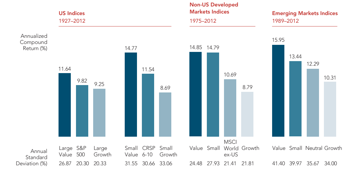
Size and Value Matter

Small cap and value effects are strong around the world. Smaller and lower-priced value stocks have higher risk and greater expected returns than larger and higher-priced growth stocks.